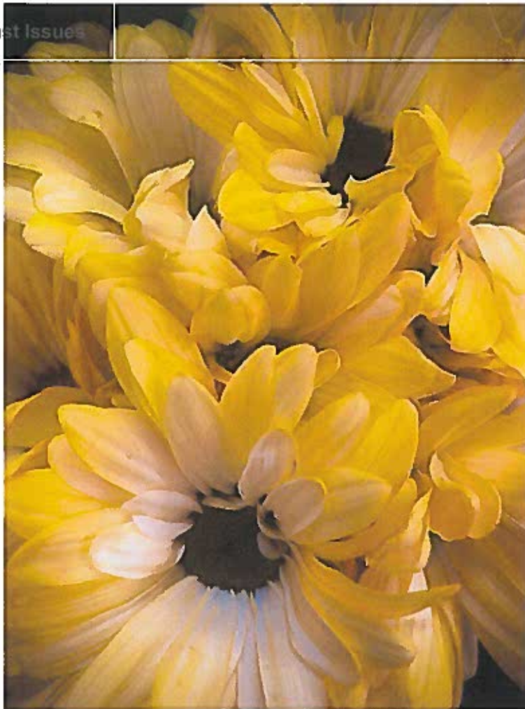
1st Place District Plant/Flora