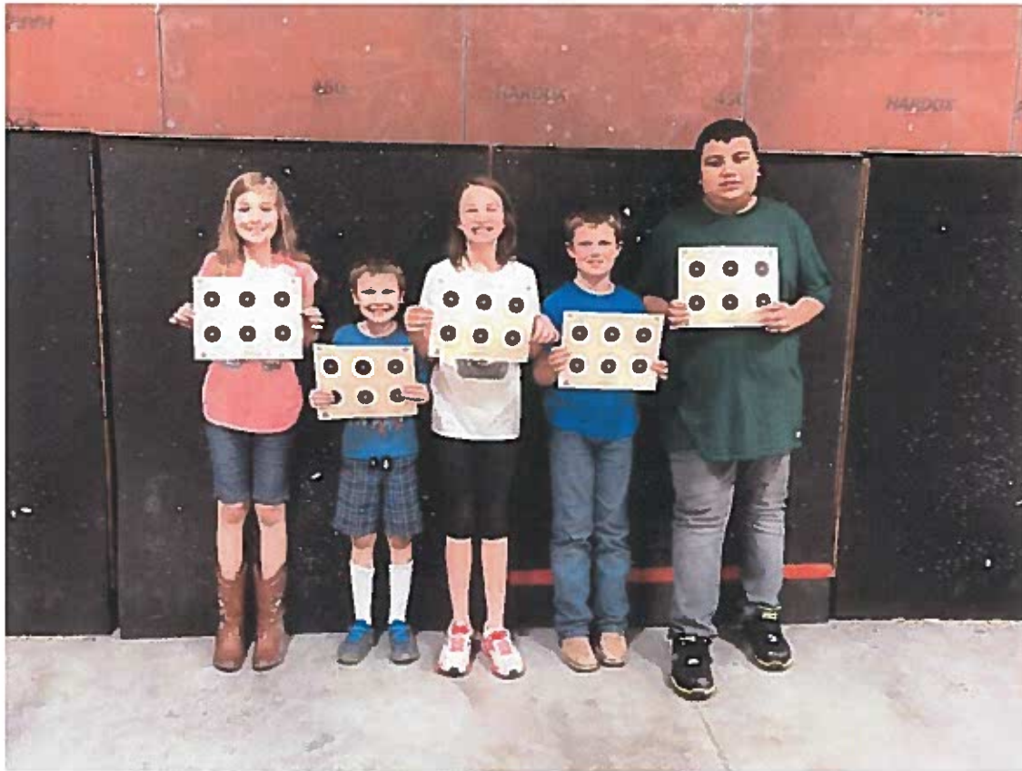
Floyd County 4-H kids at rifle practice earlier this year, we miss you all!